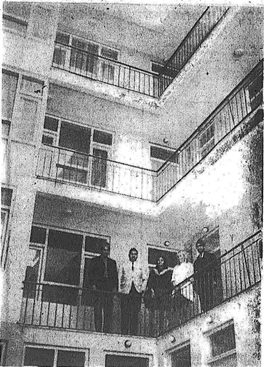
Guests enjoy the beautiful view of Zarnigar park from the balcony of the Jamil Hotel.

The Company has also bought more than one million kg. of cotton from cotton growers in Murghab district of Badghis province at the cost of more than Af. 7,000,000.